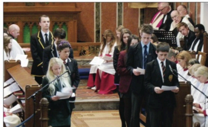
Pupils from local schools lead the intercessions.